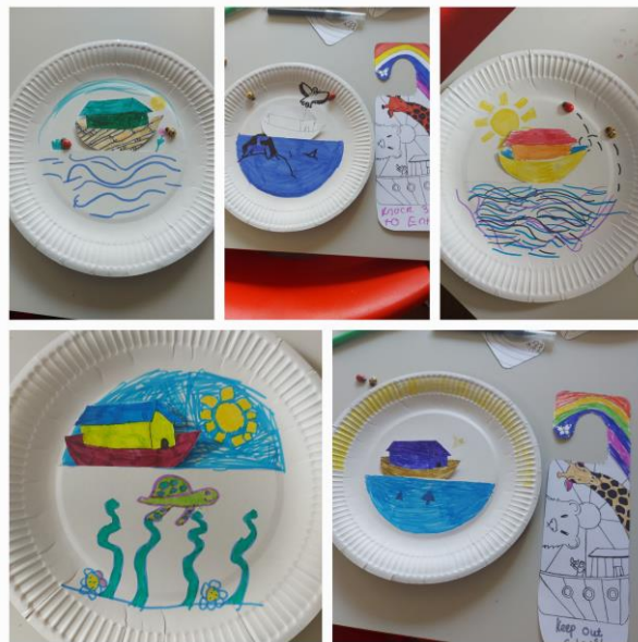
2 - Messy Church Club