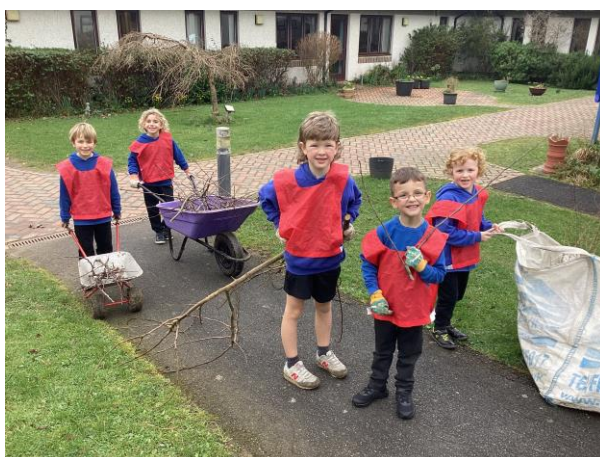
1 - Gardening Club

Well done for demonstrating our school values, being a positive role model across our school and learning to the best of your ability!