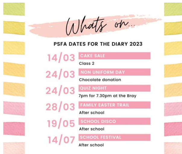
6 - PSFA Diary Dates 2023

On Thursday 9th March we will be celebrating St Piran's Day. Instead of the usual menu children will be served Meat or Cheese & Onion Pasty then dessert will be a decorated chocolate cookie. The Jacket Potato option will still be available. Please order a meal on Parentpay as usual.